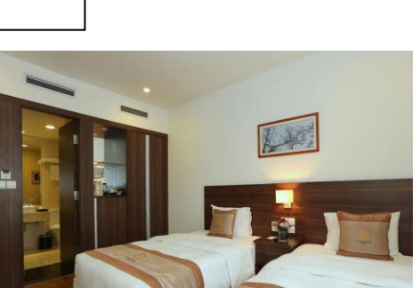
ANGEL PALACE HOTEL