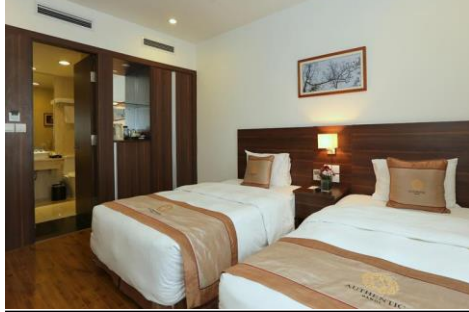
AUTHENTIC HANOI HOTEL